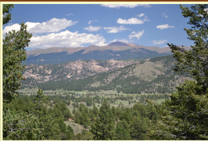
Powerful Pikes Peak Views