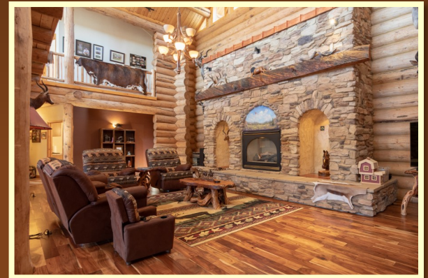
Grand Log Lodge w/ Commercial Construction