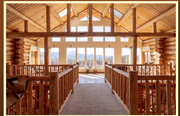
Upper Atrium w/ Natural Light & Mountain Views