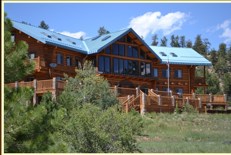
South of Florissant, Colorado (Teller County)

Ranches ~ Land ~ Homes ~ Cabins Central Colorado Mountains