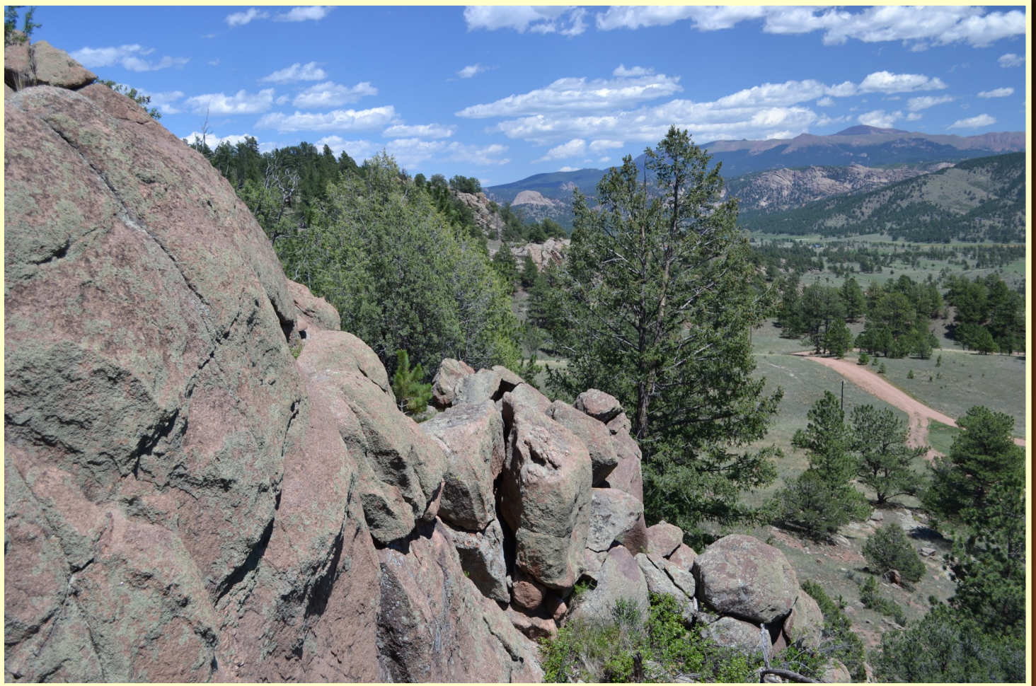
Mountain Lodge Tucked Against Towering Rock Bluffs

80.30 +/- Acres | South of Florissant, Colorado (Teller County)