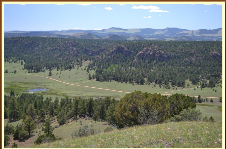
The "360" Scenery — Ponds, Valleys & Mountains