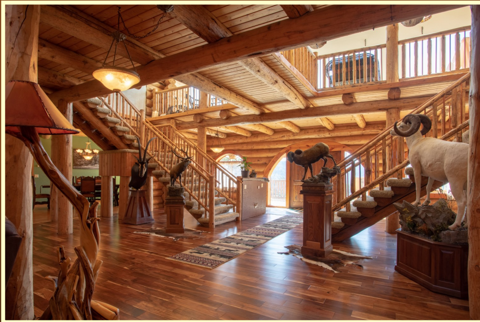
Spacious & Inviting Great Room & Entry